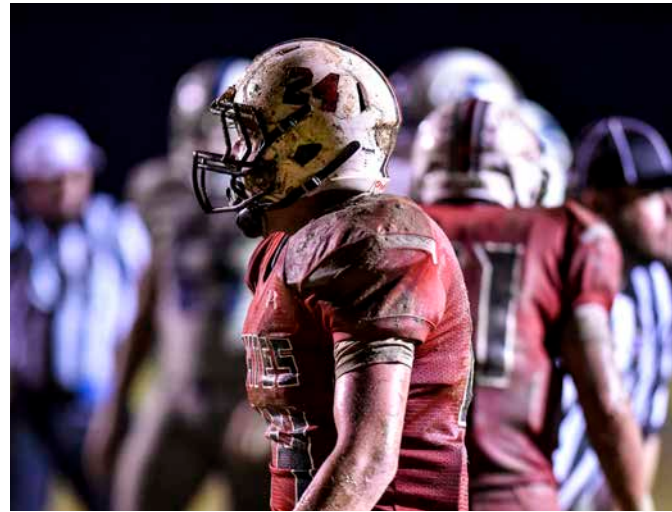
The football season kicks off near the end of the month, and Fleming-Mason Energy will help power the exciting action.

Co-op electricity lights up stadiums, locker rooms and parking lots. We power scoreboards and public address systems. We're also the power source for concession stands that crank out hot foods and cold beverages for fans.